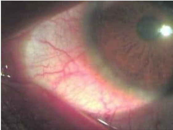
Figure 1 A : Limbal papillae in left eye before starting the treatment.

Examination : Patient was of average build with a medium complexion. On eye examination, there was a partial dropping of eyelids and in right eye there was a refractive error of -0.5 diopter cylinder at 40 degrees while in left eye -1.0 diopter at 150 degree. On Slit-lamp biomicroscopy examination, conjunctiva showed limbal papillae in left eye at inferio-nasal quadrant while palpebral papillae in both eyes more in left eye (Figure 1A, 1B). Corneal examination showed ring opacity in both eyes and punctate epithelial keratitis involving upper quadrant in left eye.