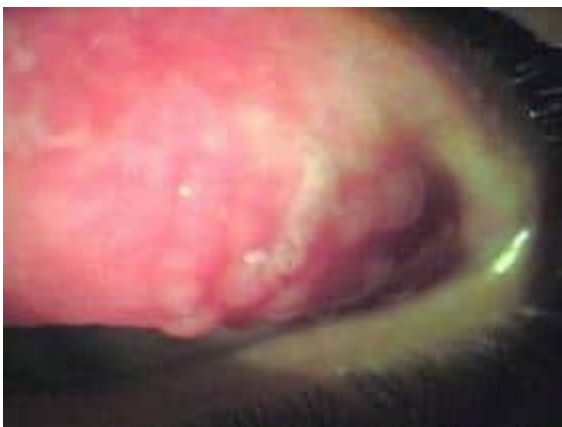
Figure 1 B : Palpebral papillae in left upper eyelid before starting the treatment.