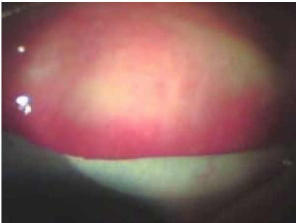
Figure 4 B : Reduction of palpebral papillae after treatment.